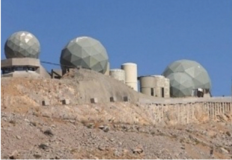
When the United States invaded Iraq it was widely under reported that one very important mission they conducted was what was believed to be a visit to the tomb of Gilgamesh – Nimrod to retrieve a sample of his DNA.

These types of locations are very important to the world's most important elites who are also some of the worlds top occultists.