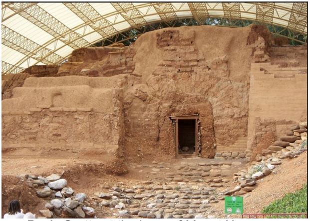
Pan's Grotto at the base of Mount Hermon